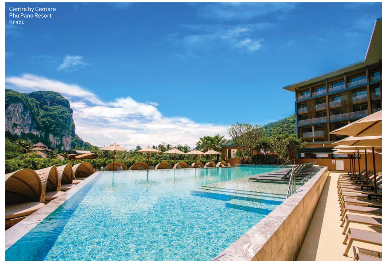
Centra by Centara Phu Pano Resort Krabi.

COURTESY OF CENTARA BY CENTARA PHU PANO RESORT KRABI