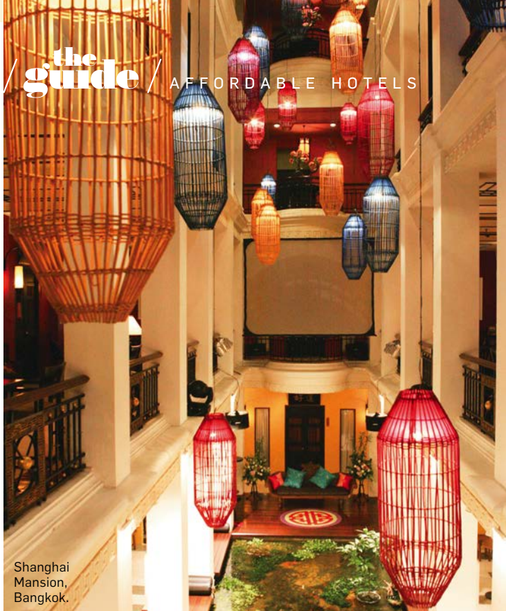
Shanghai Mansion, Bangkok.