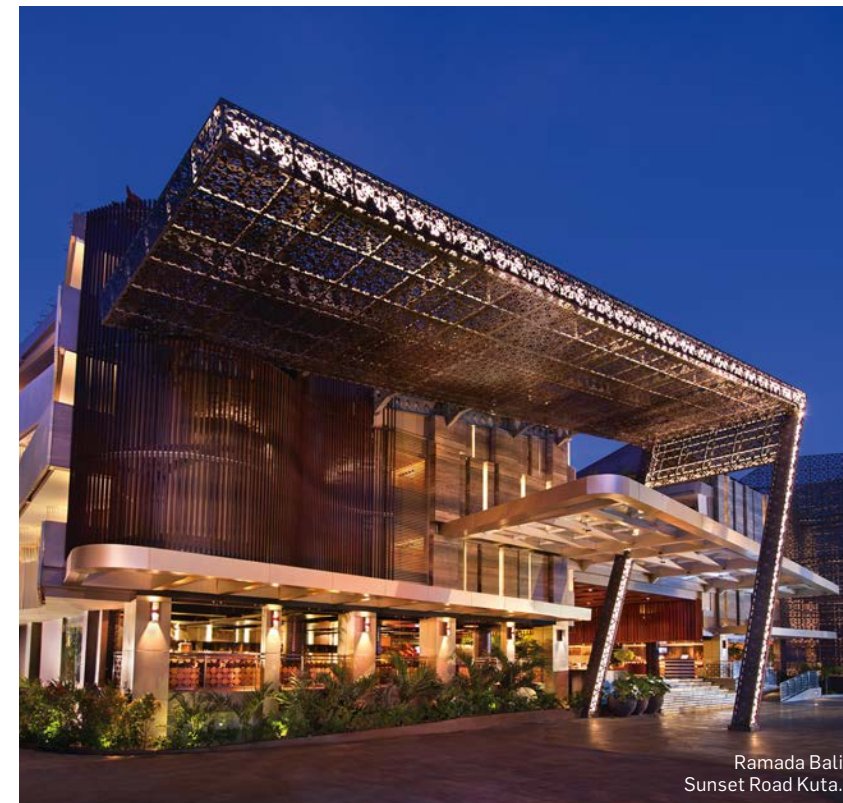
Ramada Bali Sunset Road Kuta.

Plenty of small perks are available for those willing to shell out a few more bucks on their stay.