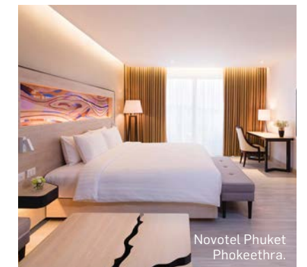
Novotel Phuket Phokeethra.