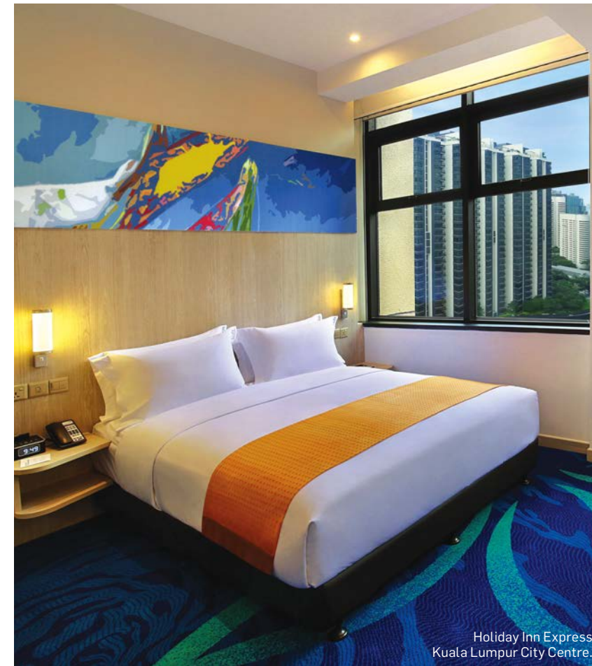
Holiday Inn Express Kuala Lumpur City Centre.