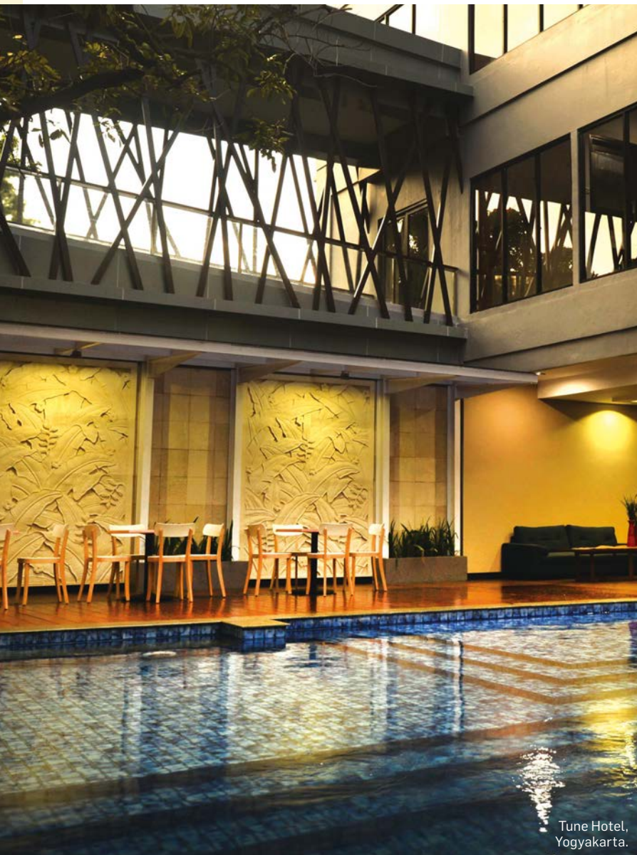
Tune Hotel, Yogyakarta.