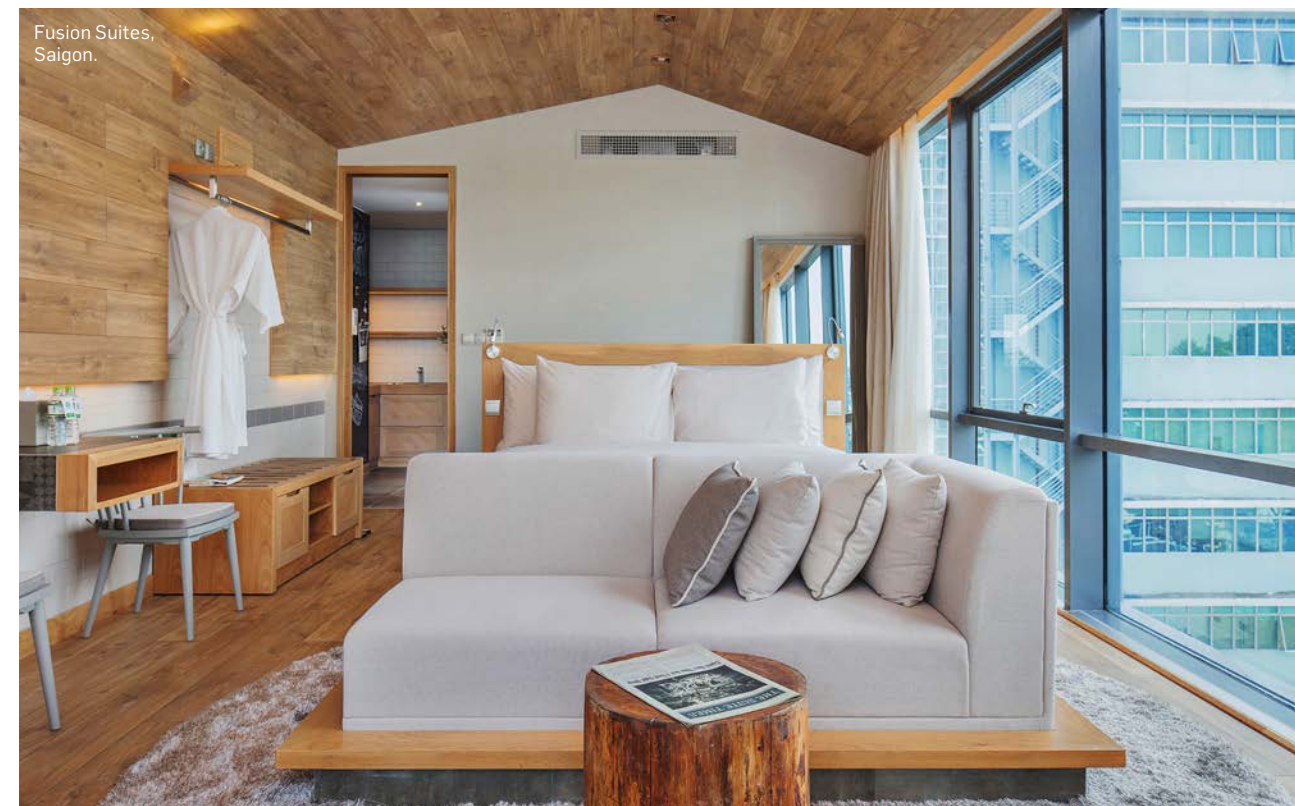
Fusion Suites, Saigon.

+ NEWCOMER: A Sri Lankan oasis ringed with palms, Avani Kalutara Resort (doubles from $125) offers yoga classes, spa treatments, watersports and games for kids. But, given its stunning location at the intersection of the Indian Ocean and Kalu Ganga River, you may be tempted just to kick back and watch the waves roll by. + minorhotels.com/avani.