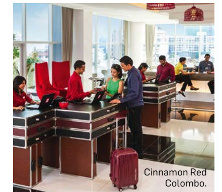
Cinnamon Red Colombo.