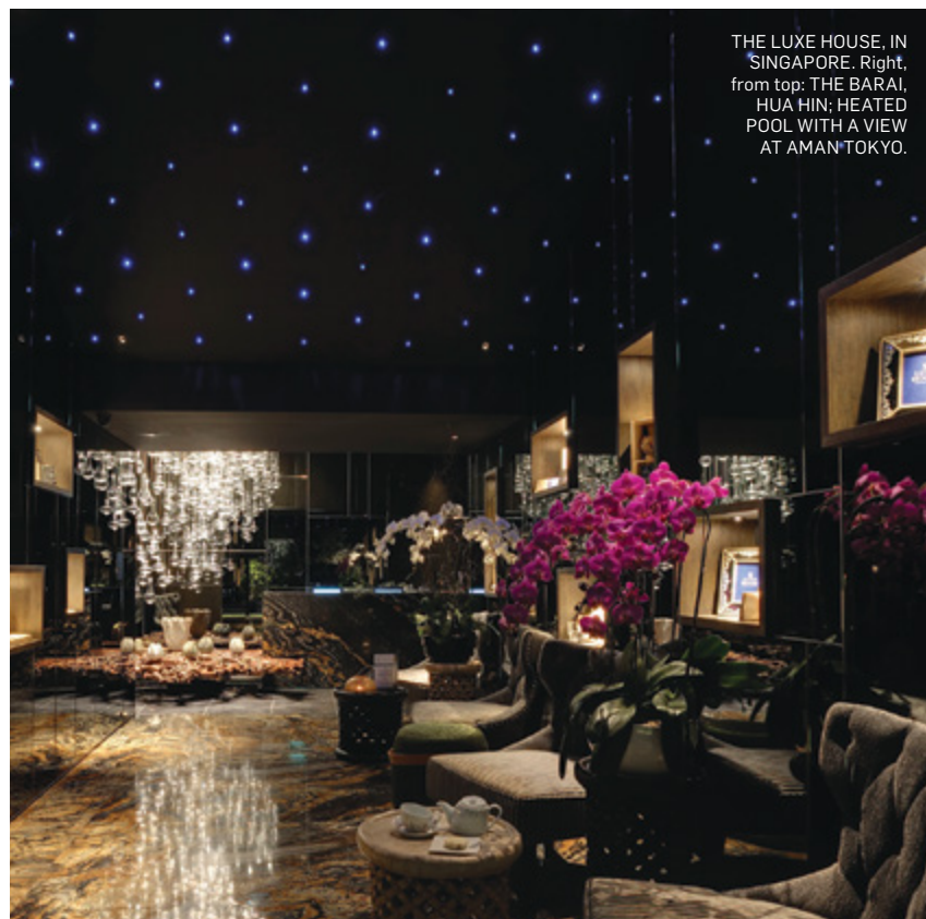
THE LUXE HOUSE, IN SINGAPORE. Right, from top: THE BARAI, HUA HIN; HEATED POOL WITH A VIEW AT AMAN TOKYO.