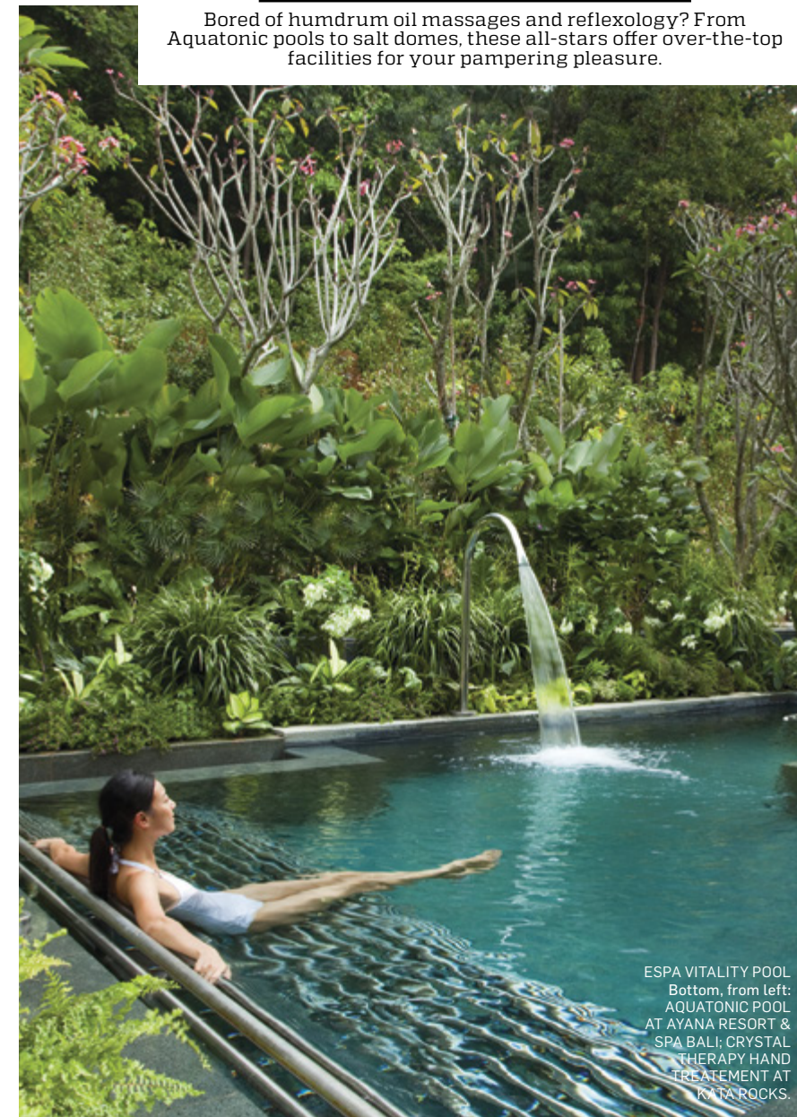
ESPA VITALITY POOL Bottom, from left: AQUATONIC POOL AT AYANA RESORT & SPA BALI; CRYSTAL THERAPY HAND TREATMENT AT KATA ROCKS.

Bored of humdrum oil massages and reflexology? From Aquatonic pools to salt domes, these all-stars offer over-the-top facilities for your pampering pleasure.