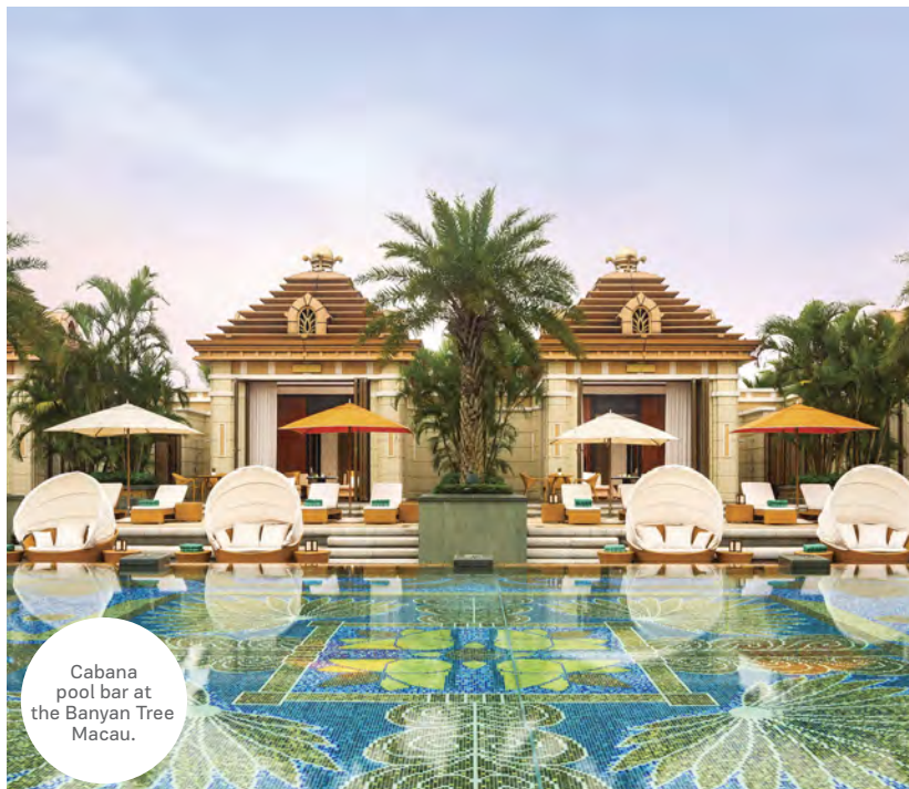
Cabana pool bar at the Banyan Tree Macau.

Try one of these four trips to keep the green season from raining on your parade.